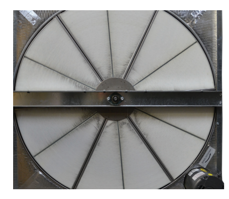
Energy Recovery Wheel