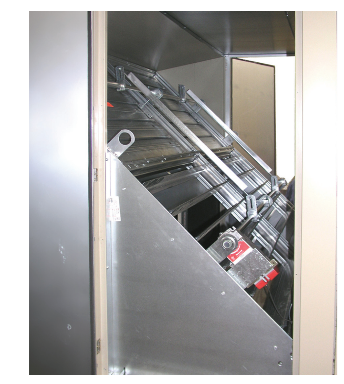
Standard low-leak dampers for superior resistance to air leakage and reduced energy costs.

Stainless steel, double-sloped drain pans per ASHRAE Standard 62.1-2004 for good indoor air quality.