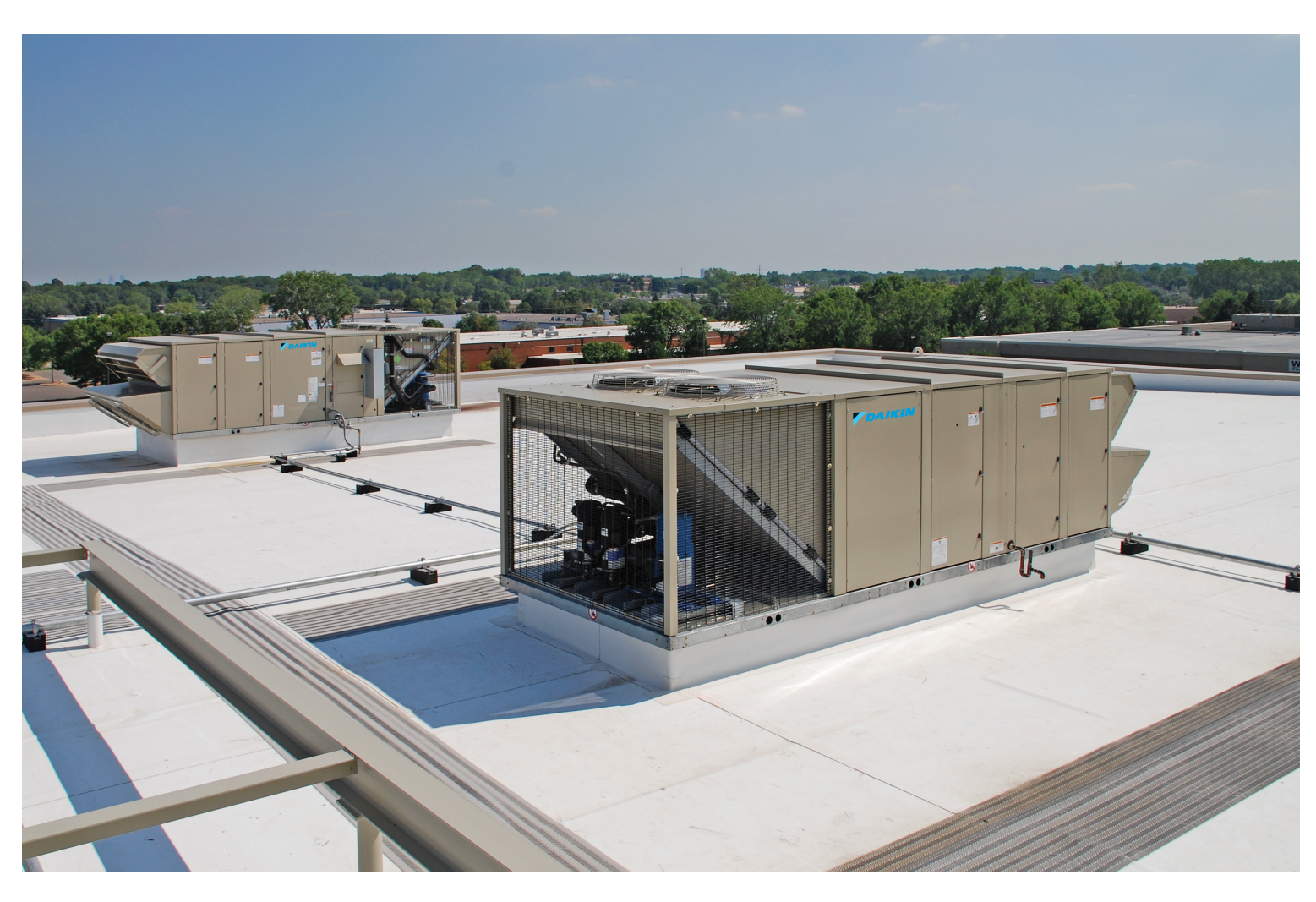
Maverick II rooftop systems are ideal for 100% dedicated outdoor air systems (DOAS). Units can be equipped with modulating hot gas reheat to increase occupant comfort and avoid over-cooling and units can incorporate an optional energy recovery wheel that can drastically improve operational costs. Also available is a 100° temperature-rise furnace for unit operation in cold-weather climates.