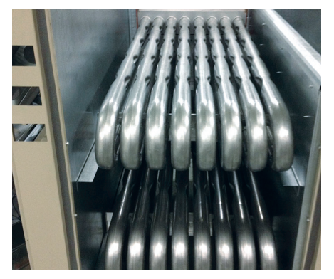
Gas Furnace Tubes