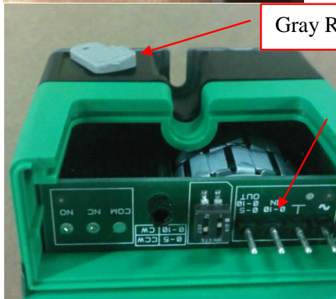
Gray Release Lever