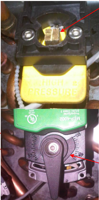
Valve Stem Marking