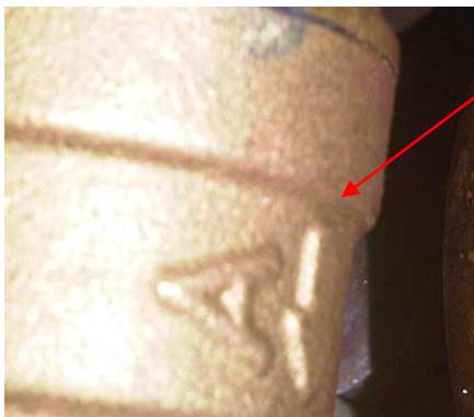
Water Direction Arrow

If for any reason you need to remove these actuators, follow these steps outlined here in making sure you have the valve actuator placed in the correct position.