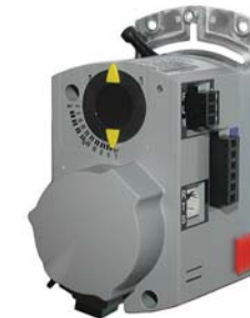
TEC Controller with Actuator