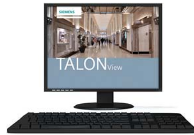
TALON View Workstation

The TALON system is able to seamlessly link BACnet, LonTalk, Modbus and other common open-protocol devices into a single, robust control system.