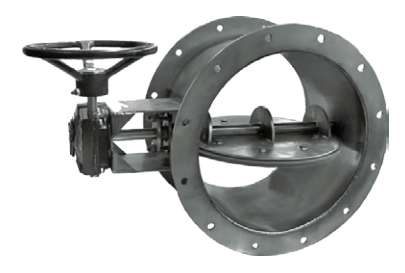
Round Bubble-Tight Damper – Used for isolation of a filter or a filter bank. This damper can also be used as a non-modulating control damper.

The bubble-tight isolation dampers are AAF Flanders top-ofthe-line dampers. These dampers were specifically designed to provide cost-effective isolation of filter banks with high volumes of air. Each bubble-tight damper is leak tested at the factory to ensure a "bubble-tight" seal at a differential pressure of 10 inches water gage. Isolation dampers are available with the standard manual actuator or optional electric or pneumatic actuators.