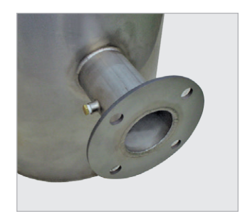
1/4" Thick Plate Flange – Static Pressure Tap