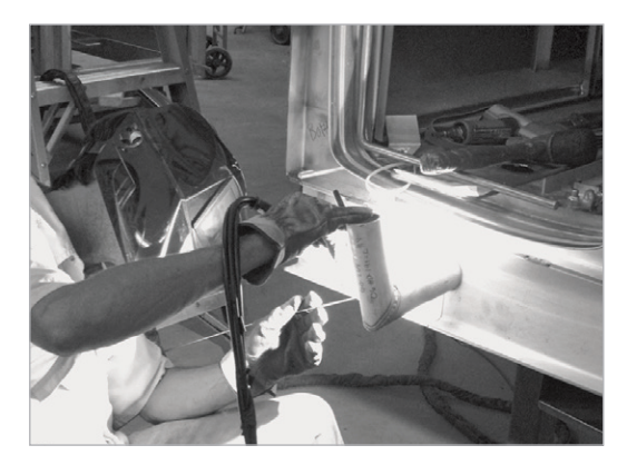
ASME, Section IX Qualified Welder Working on a Bag-in/ Bag-out Filter Housing

All welding procedures, welders, and welder operators are qualified in accordance with ASME Boiler and Pressure Vessel Code, Section IX. All production welds are visually inspected per AAF Flanders Standard Work Instruction WI-03-022, Visual Inspection of Welds, which incorporates the workmanship acceptance criteria described in Sections 5 and 6 of ANSI/AWS D9.1 Welding Code—Specifications for Welding Sheet Metal.