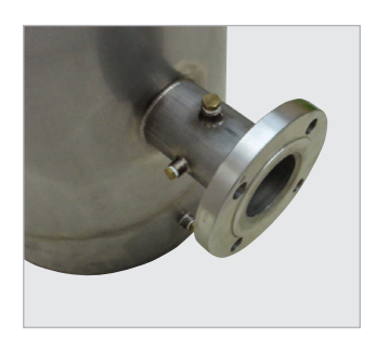
150 Lbs. Flange Test Port – Static Pressure Tap Drain Port