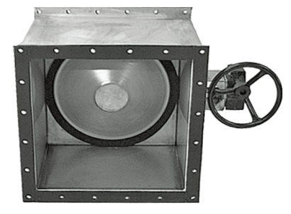
Square Bubble-Tight Damper – Used for isolation of a filter or a filter bank primarily during the filter changeout process.