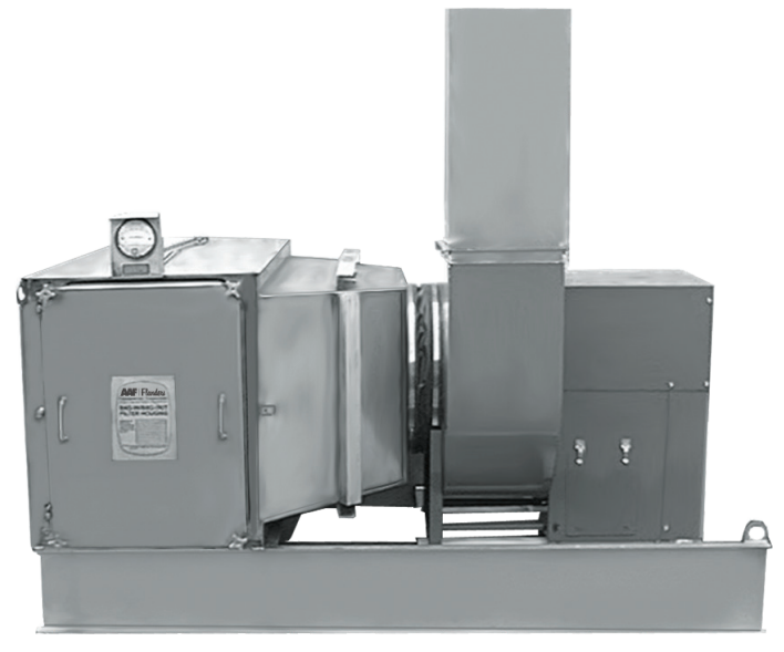
BG Series SC-1000 with Optional No-loss Stack