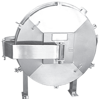
Door Hinge Mounting Legs

design pressure is greater than positive or negative 7 PSIG, the door is held in place by bolted and gasketed flanges located on the door and housing. The inlet and outlet connections are rolled and seam-welded nipple connection sizes up to 12" long, or as specified by the design professional.