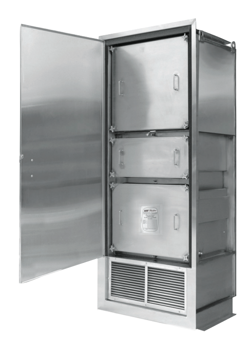
AAF Flanders Laminar Flow Wall Pharma Containment System

AAF Flanders products have established the benchmark for conscientious design in quality containment air filtration.