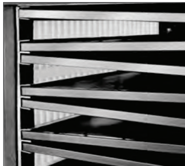
Side Access Carbon, side view, showing "V" bank trays.

Each Side Access Carbon tray is furnished with 45 pounds of activated charcoal per 1,000 CFM of rated capacity. The retention time of the gas stream at the rated flow of 500 FPM is 0.09 seconds. Retention time can be increased by installing multiple housings in series or in parallel, or reducing the flow rate. The trays have a removable end cap which allows them to be refilled with fresh adsorbent on site. If desired, the emptied trays can be returned for refill.